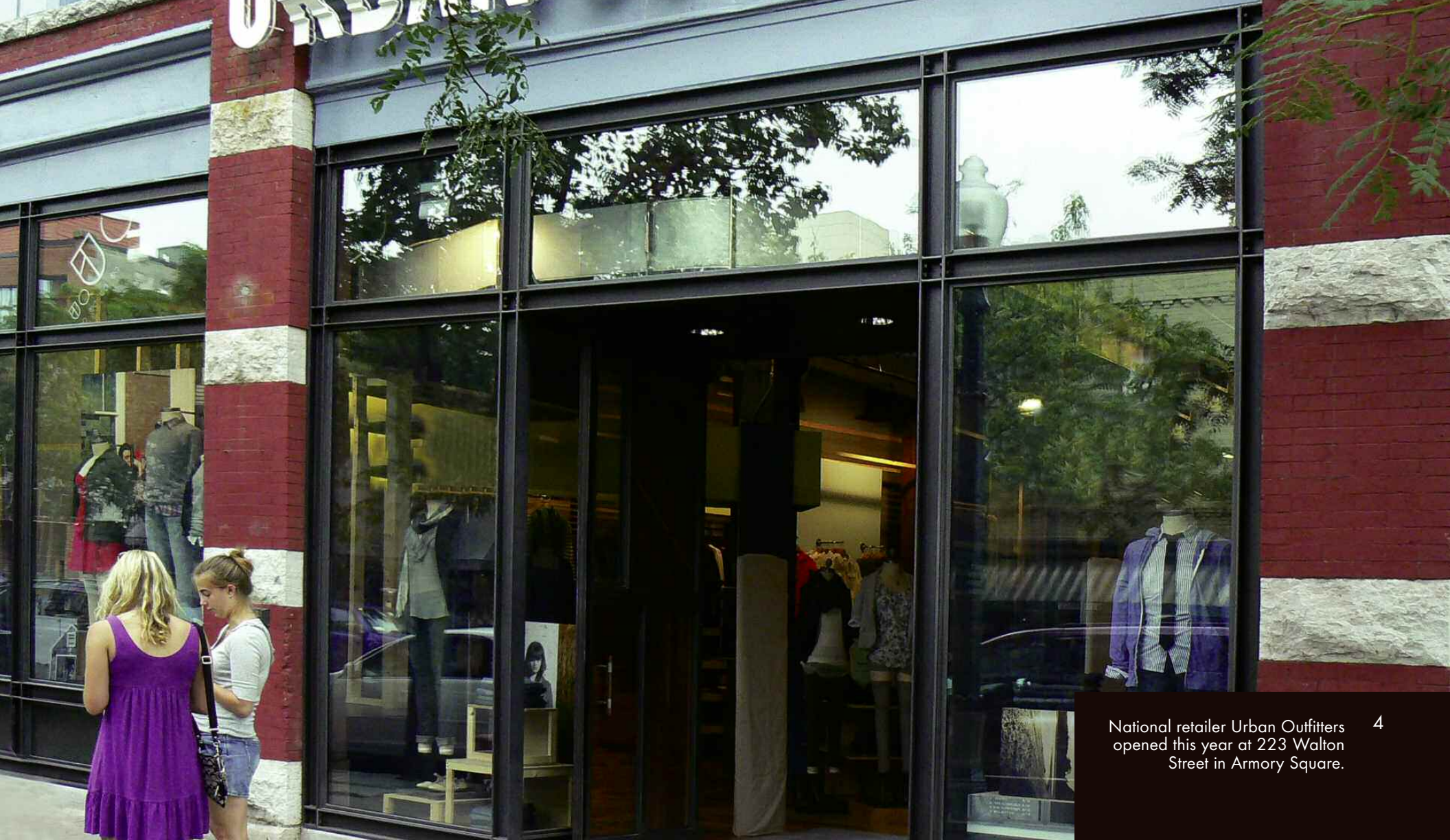
National retailer Urban Outfitters opened this year at 223 Walton Street in Armory Square. 4