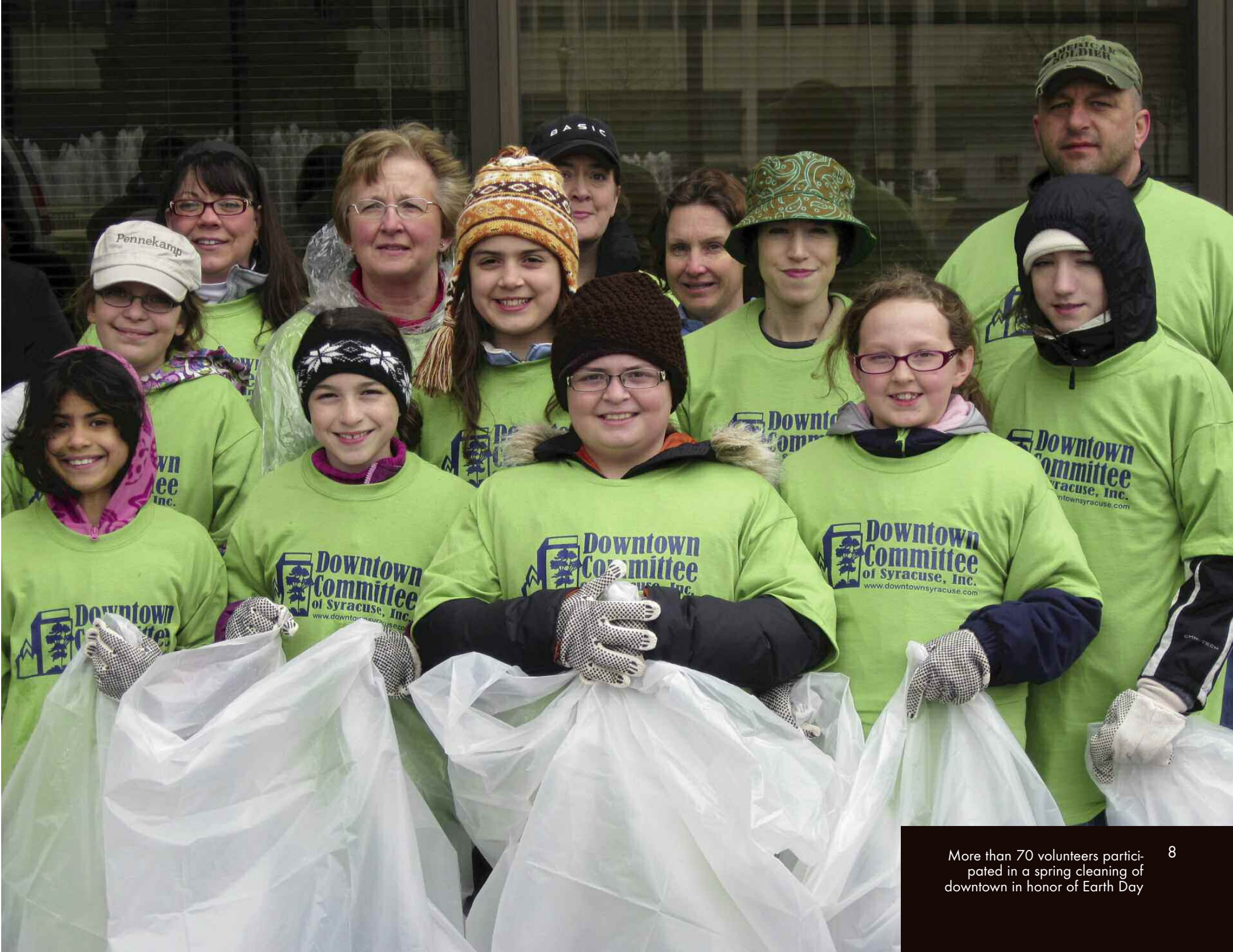
More than 70 volunteers participated in a spring cleaning of downtown in honor of Earth Day