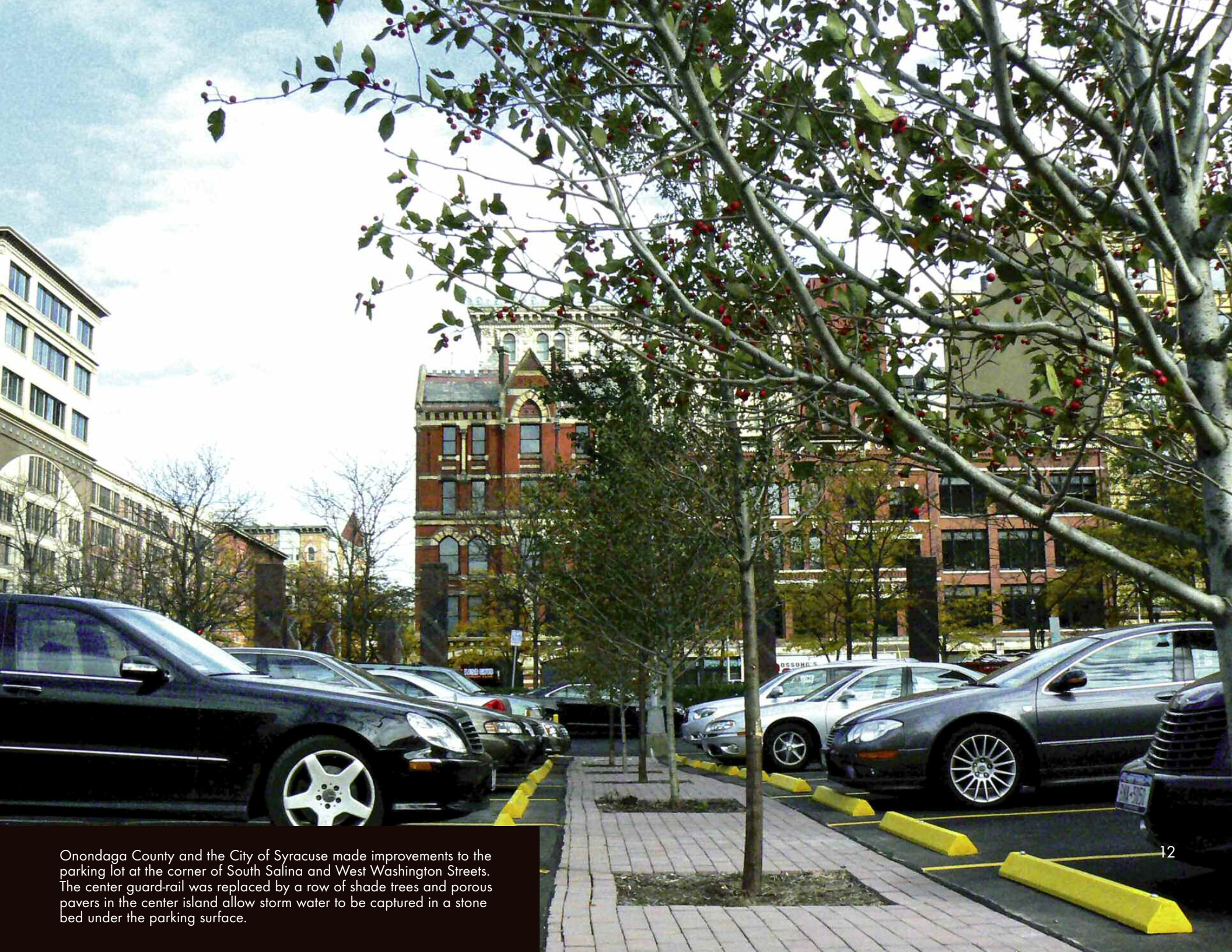
Onondaga County and the City of Syracuse made improvements to the parking lot at the corner of South Salina and West Washington Streets. The center guard-rail was replaced by a row of shade trees and porous pavers in the center island allow storm water to be captured in a stone bed under the parking surface.